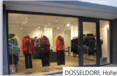
DÜSSELDORF, Hohe Straße 16

Our focus this season was on the development of the American market. The new location in New York and the new openings in Montclair (New Jersey), Pasadena (close to Los Angeles) and Mill Valley (San Francisco Bay) were well received.