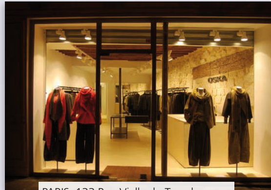
PARIS, 133 Rue Vielle du Temple