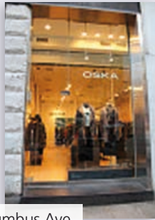
NEW YORK, 311 Columbus Ave