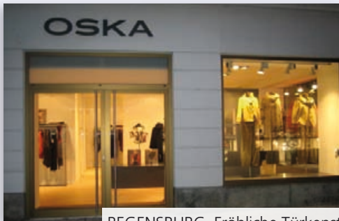
REGENSBURG, Fröhliche Türkenstraße 2